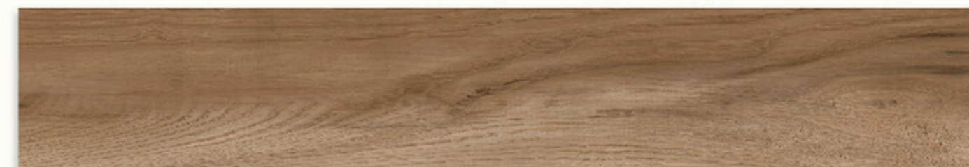
MARRONE LEGNO GDW03 | 120x20