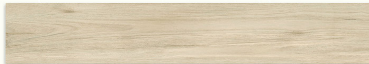
LEGNO BEIGO GDW02 | 120x20