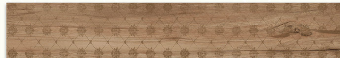
MARRONE LEGNO LISTELLO B | 120x20