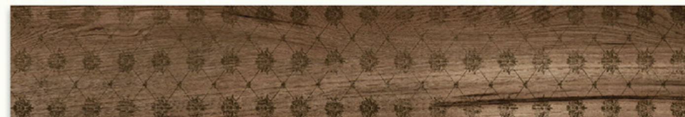
LEGNA CASTANO LISTELLO B | 120x20