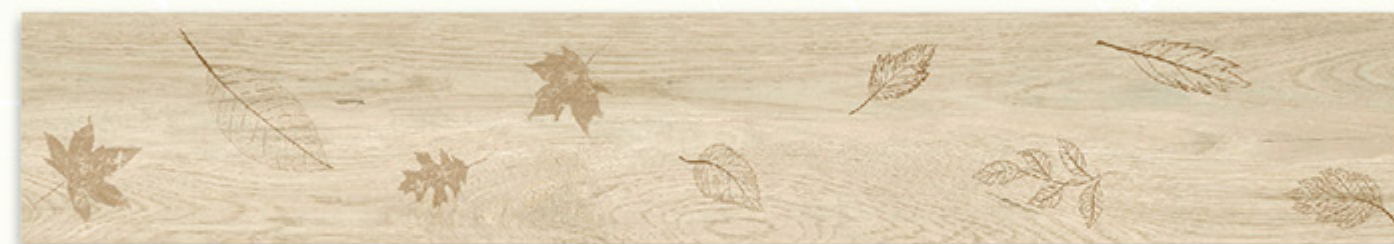
LEGNO BEIGO LISTELLO A | 120x20