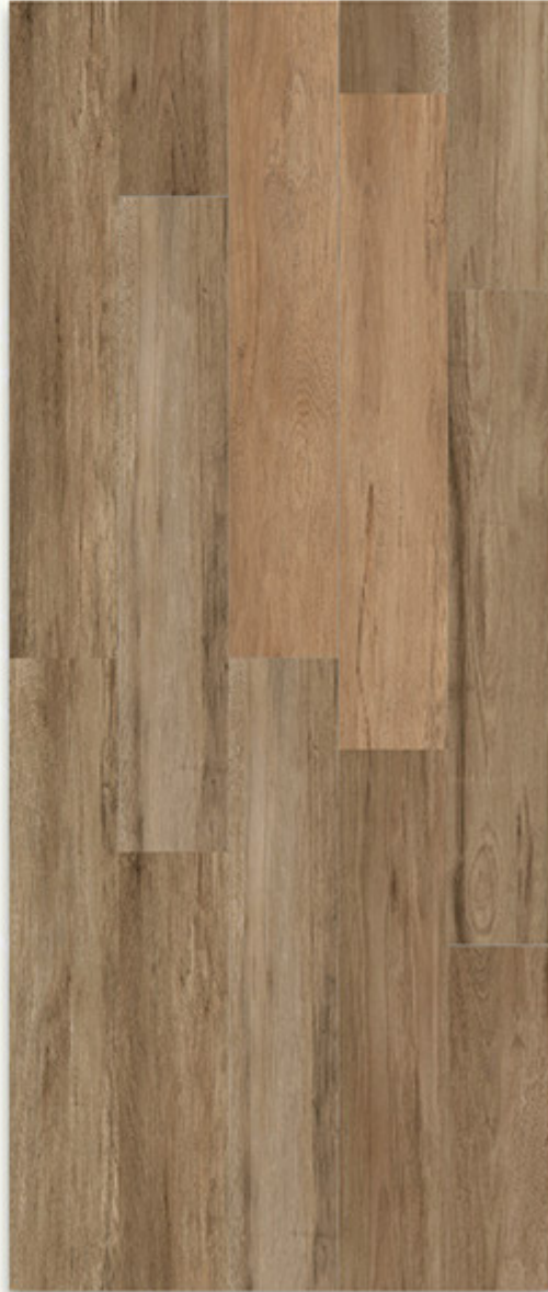
SOFTWOOD FLOOR MARRONE LEGNO GDW03 WALL MARRONE LEGNO LISTELLO C 120x20

SIZE 20x120 SURFACE SLIGHTLY STRUCTURED ACCESSORIES LISTELLO A,B,C