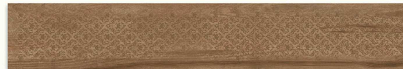
MARRONE LEGNO LISTELLO C | 120x20