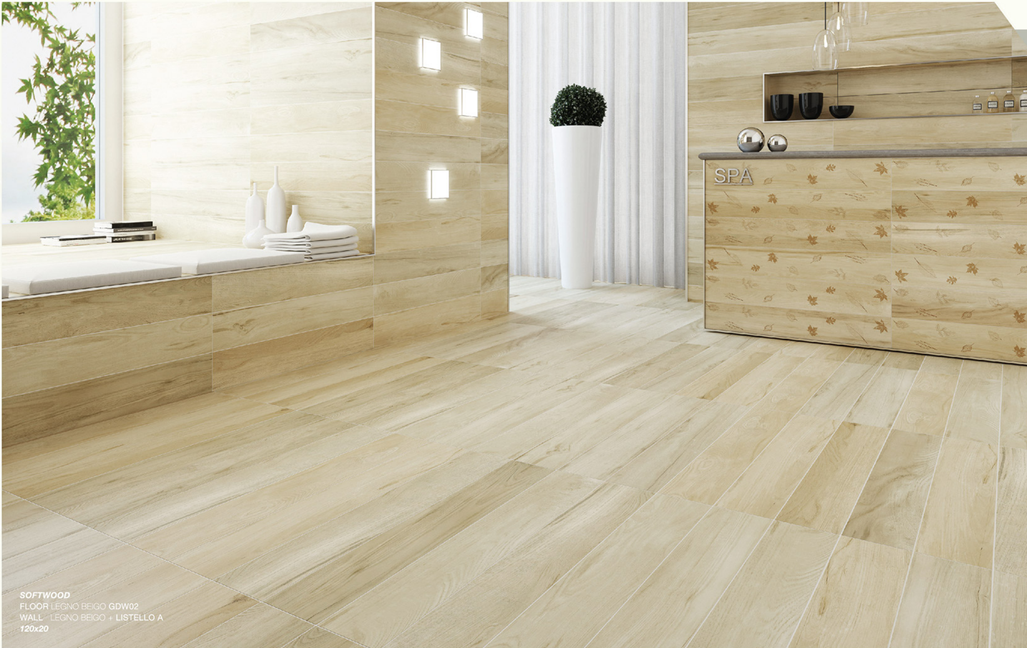
SOFTWOOD FLOOR LEGNO BEIGO GDW02 WALL LEGNO BEIGO + LISTELLO A 120x20