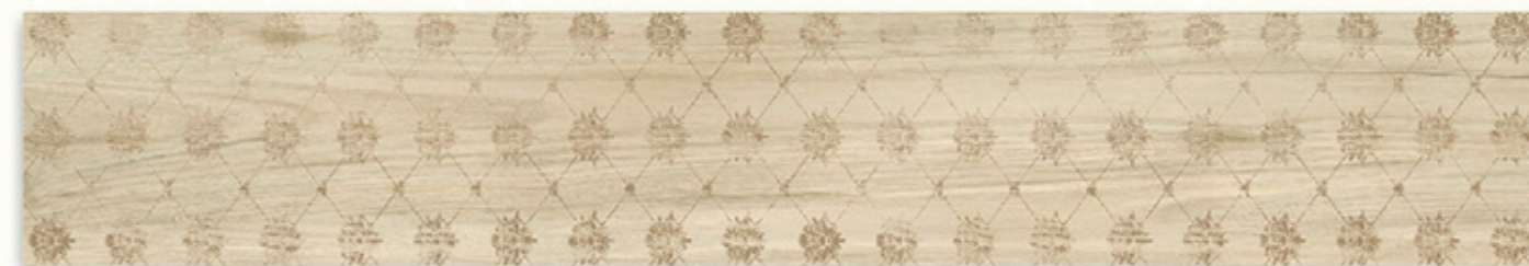
LEGNO BEIGO LISTELLO B | 120x20