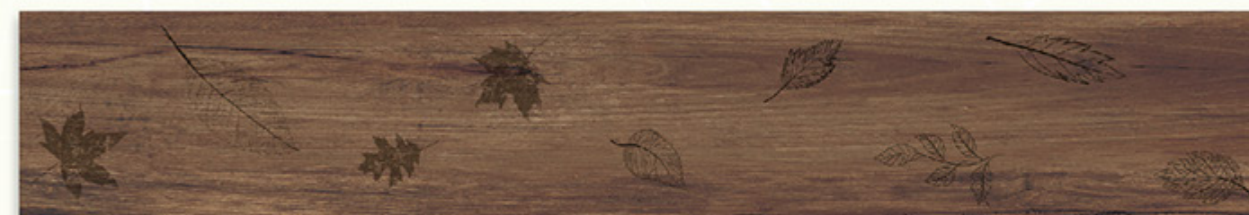
LEGNA CASTANO LISTELLO A | 120x20