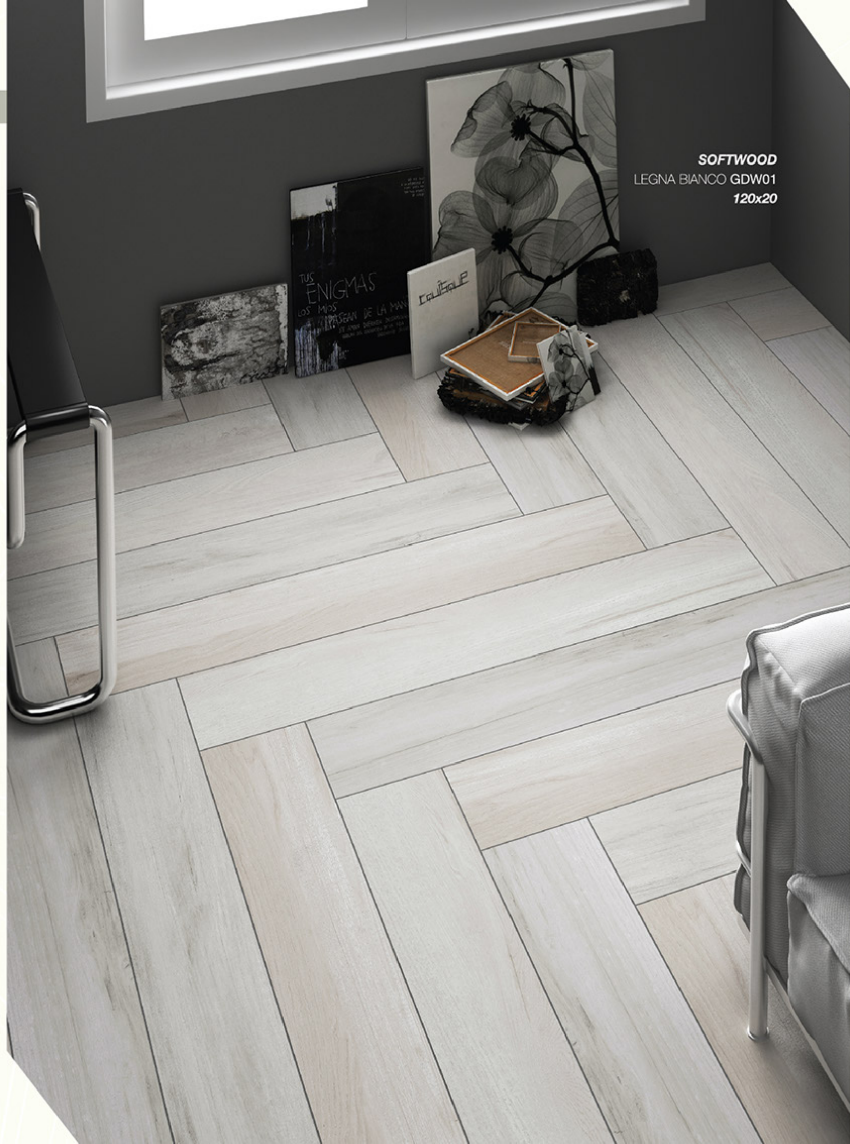
SOFTWOOD LEGNA BIANCO GDW01 120x20