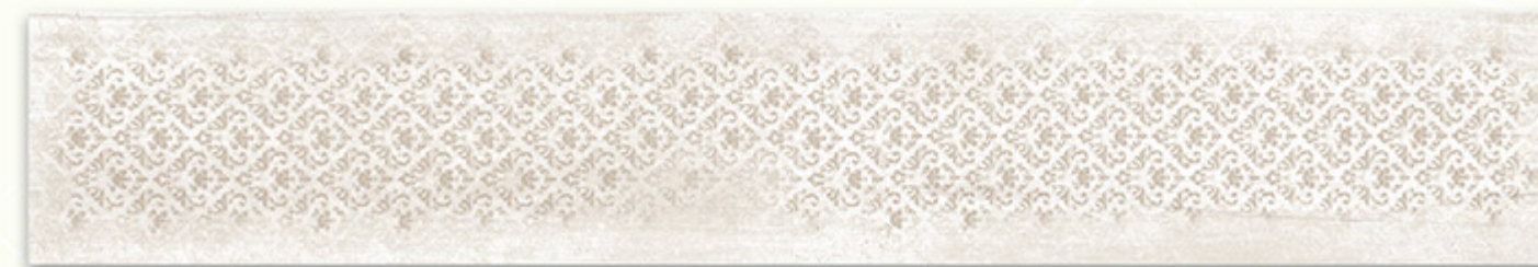
LEGNA BIANCO LISTELLO C | 120x20