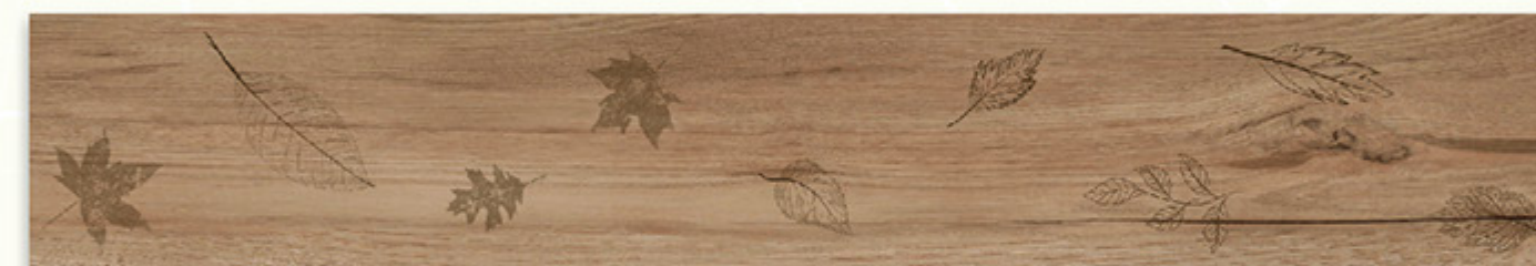
MARRONE LEGNO LISTELLO A | 120x20