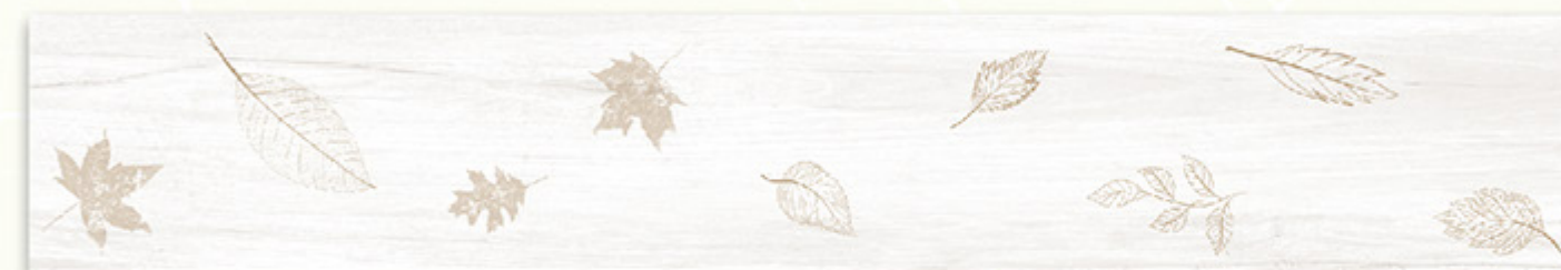
LEGNA BIANCO LISTELLO A | 120x20