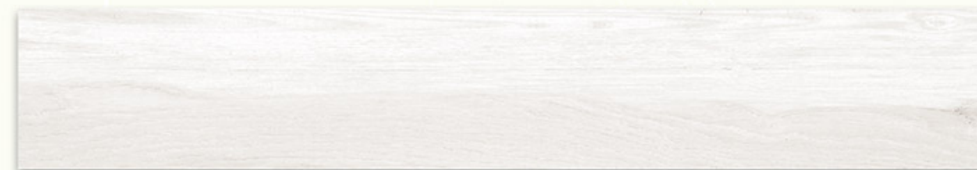
LEGNA BIANCO GDW01 | 120x20