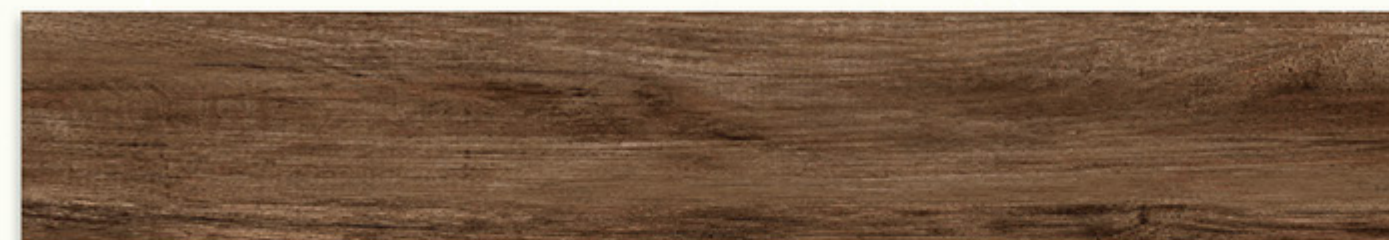
LEGNA CASTANO GDW04 | 120x20