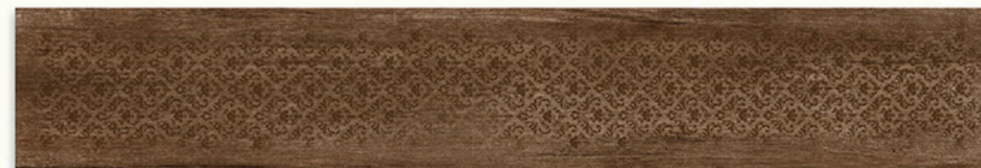
LEGNA CASTANO LISTELLO C | 120x20