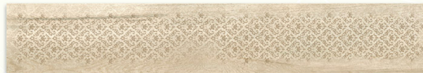
LEGNO BEIGO LISTELLO C | 120x20