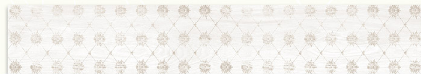
LEGNA BIANCO LISTELLO B | 120x20