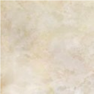
60x60 cm Vitrified - Polished rect. ± 9,1 mm