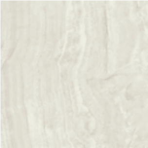
60x60 cm Vitrified - Satin rect. ± 9,1 mm