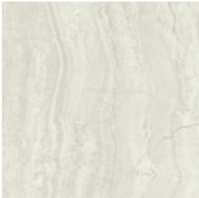
80x80 cm Vitrified - Polished rect. ± 11,5 mm