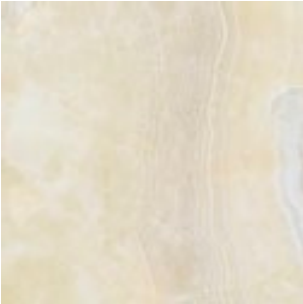
60x60 cm Vitrified - Satin rect. ± 9,1 mm