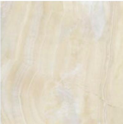
80x80 cm Vitrified - Satin rect. ± 11,5 mm