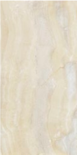
60x120 cm Vitrified - Satin rect. ± 11 mm