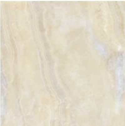
80x80 cm Vitrified - Polished rect. ± 11,5 mm