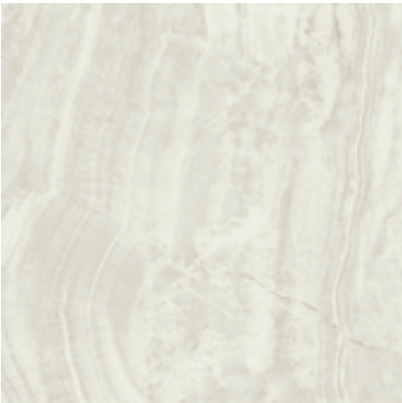
80x80 cm Vitrified - Satin rect. ± 11,5 mm