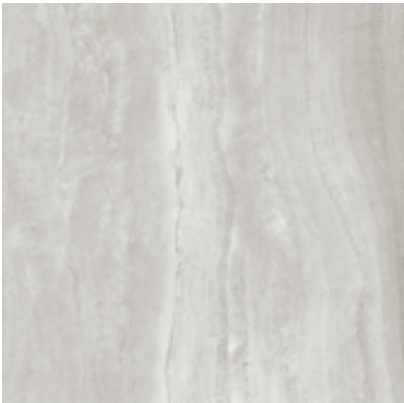
80x80 cm Vitrified - Satin rect. ± 11,5 mm