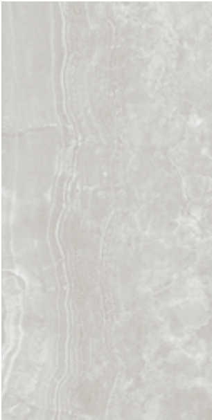
60x120 cm Vitrified - Polished rect. ± 11 mm