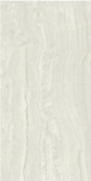
60x120 cm Vitrified - Satin rect. ± 11 mm