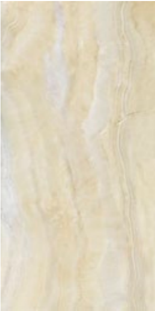
60x120 cm Vitrified - Polished rect. ± 11 mm