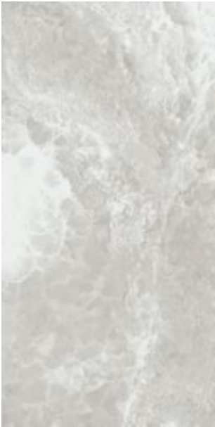
60x120 cm Vitrified - Satin rect. ± 11 mm