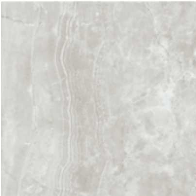
80x80 cm Vitrified - Polished rect. ± 11,5 mm