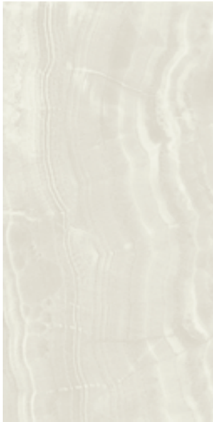
60x120 cm Vitrified - Polished rect. ± 11 mm